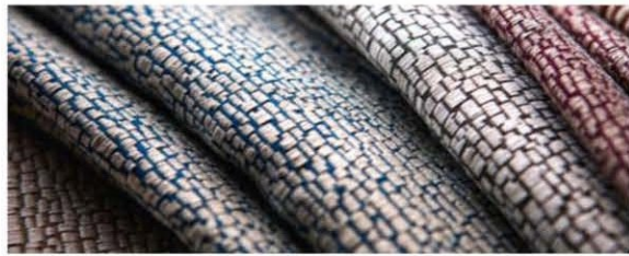
100/2 100% Cotton