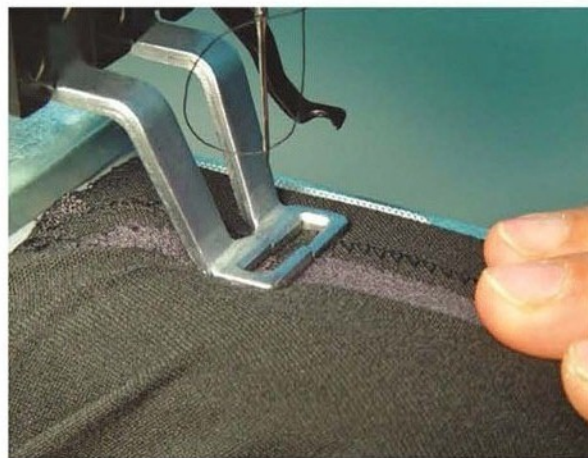
Union Special, USA