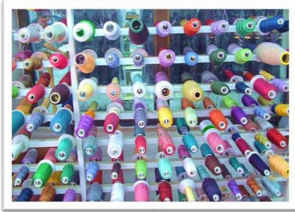
The finest long staple yarns