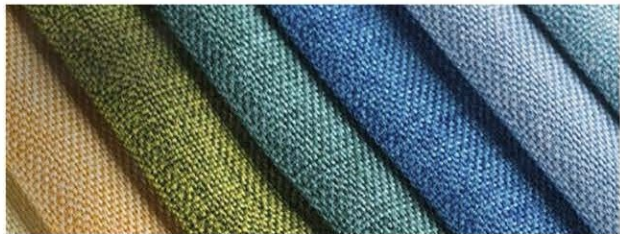
80/1 100% Linen