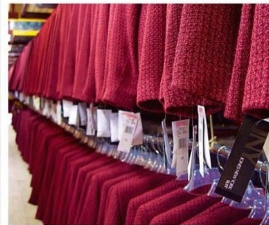
Storage & Shipping facilities

Our production capacities are continuously growing to accommodate the growing global demand.