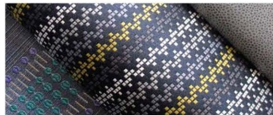
80% Cotton 20% Polyviscose

Our vertical integration allows us to produce all kinds of woven fabrics, ranging from high quality worsted wool, carded wool and wool blends to fine woven Egyptian cotton fabrics, according to customer needs. That is in addition to our major specialization in the tailoring of men's and ladies wear, ranging from tailored suits to shirts, trousers, etc.