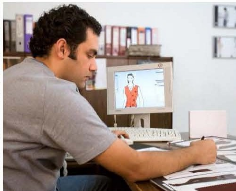
Beyond the figures you will find a young and enthusiastic team hard at work