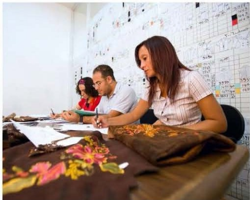
We currently employ over a thousand employees.