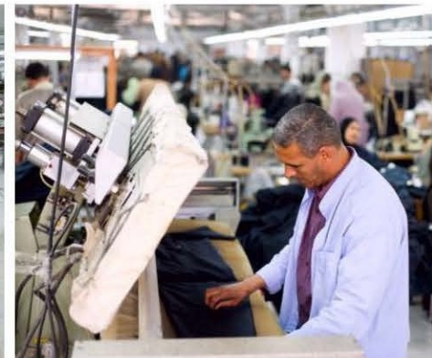
Hoffman Press, USA

As top quality apparel manufacturers, our process begins with research, design, and product development, then continues on through apparel pattern-making and grading.